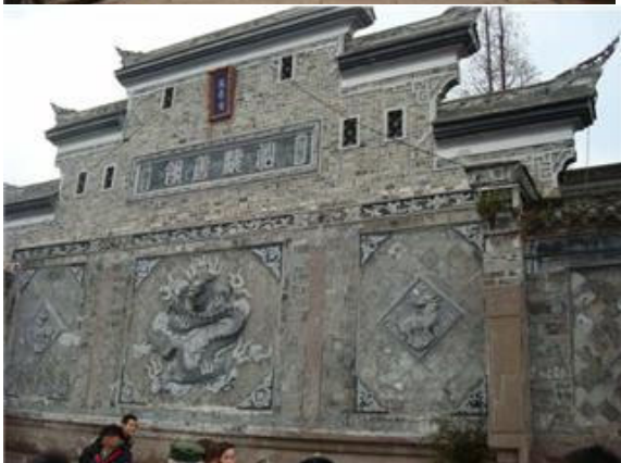
In the streets of the Ancient town of LuoDai

One of the crafts commonly seen throughout the market is batik, several shops sell unique batik clothing. There are many snack food places with local food to try for lunch. The street through the town is nice and wide. After walking around the village we left for the Great Wall.