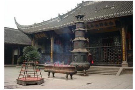
Inside Bao Monastery

trees along with miniature bright yellow plum rose trees.