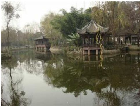
XinDu Cinnamon Lake

Day two we headed off to The Ancient Town of LuoDai (with lunch on our own)