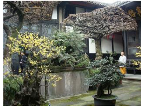
Sacred garden in the Bao Monastery