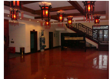
The lobby inside the hotel at the Bao Monastery

Upon finishing the tour we headed for the Xindu Cinnamon Lake (a private garden, Guili).