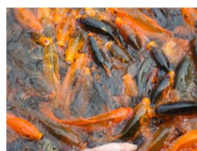
Feeding the fish in the lake is a must

The garden is very quiet and occupied mostly by retired individuals having their daily exercise by either walking or doing their Tai chi. Located in one section of the garden there is a tea house where Osmathum tea is served (very nice flavor) and very welcomed on a cool day. While walking back to the tea garden you may notice bird cages hanging from some of the trees surrounding the tea garden. The local people will bring their birds from home in their cages and hang them from the trees for fresh air while they have their afternoon tea. Then we headed back to the monastery for dinner at a local vegetarian restaurant close by.